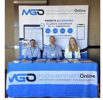
Annual BOAL conference in Lake Charles, LA