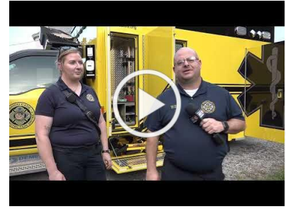
HTV 10 Bayou Time reported on the event.

providing funding for fun educational resources.