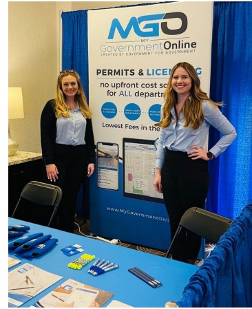
Building Professional Institute Conference in Houston, TX