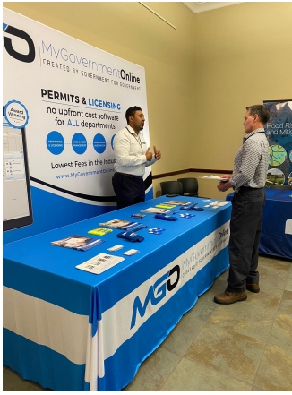
Louisiana Floodplain Management Association - LFMA Technical & Business Conference

Our MGO team participates in many conferences, here are just a few of those: