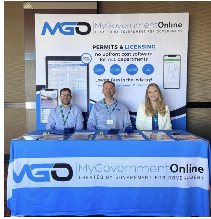
Annual BOAL conference in Lake Charles, LA