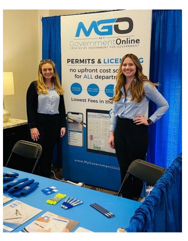
Building Professional Institute Conference in Houston, TX