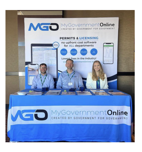
Annual BOAL conference in Lake Charles, LA