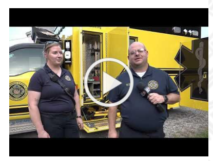
HTV 10 Bayou Time reported on the event.

providing funding for fun educational resources.