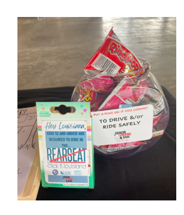
Thank you State Farm for

Plantation on October 3rd. National Night Out is an annual initiative aimed at fostering community cohesion and strengthening the bond between the police and