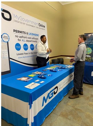
Louisiana Floodplain Management Association - LFMA Technical & Business Conference

Our MGO team participates in many conferences, here are just a few of those: