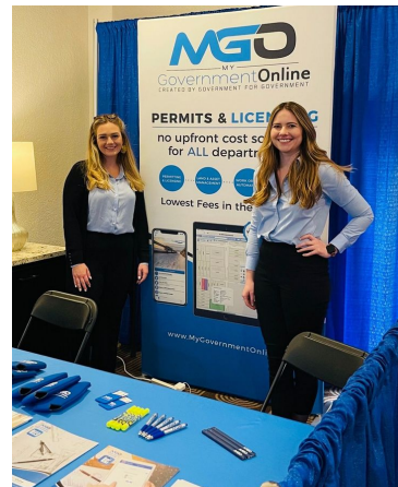
Building Professional Institute Conference in Houston, TX